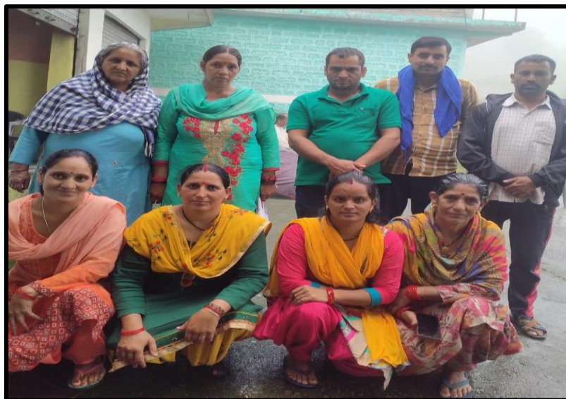
Members of Ridhi Sidhi Self Help Group of VFDS Goverta

SHG/Name : Ridhi Sidhi SHG VFDSName : Goverta FTU/Range : Baldwara DMU/Division : Suket FCCU/Circle : Mandi